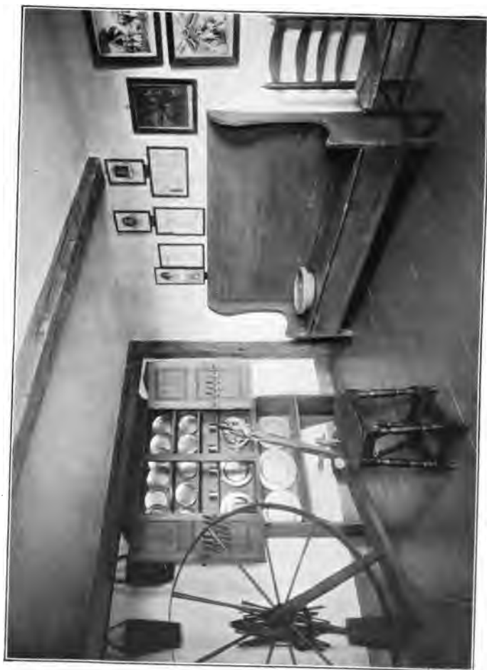
THE COMMUNITY SETTLE